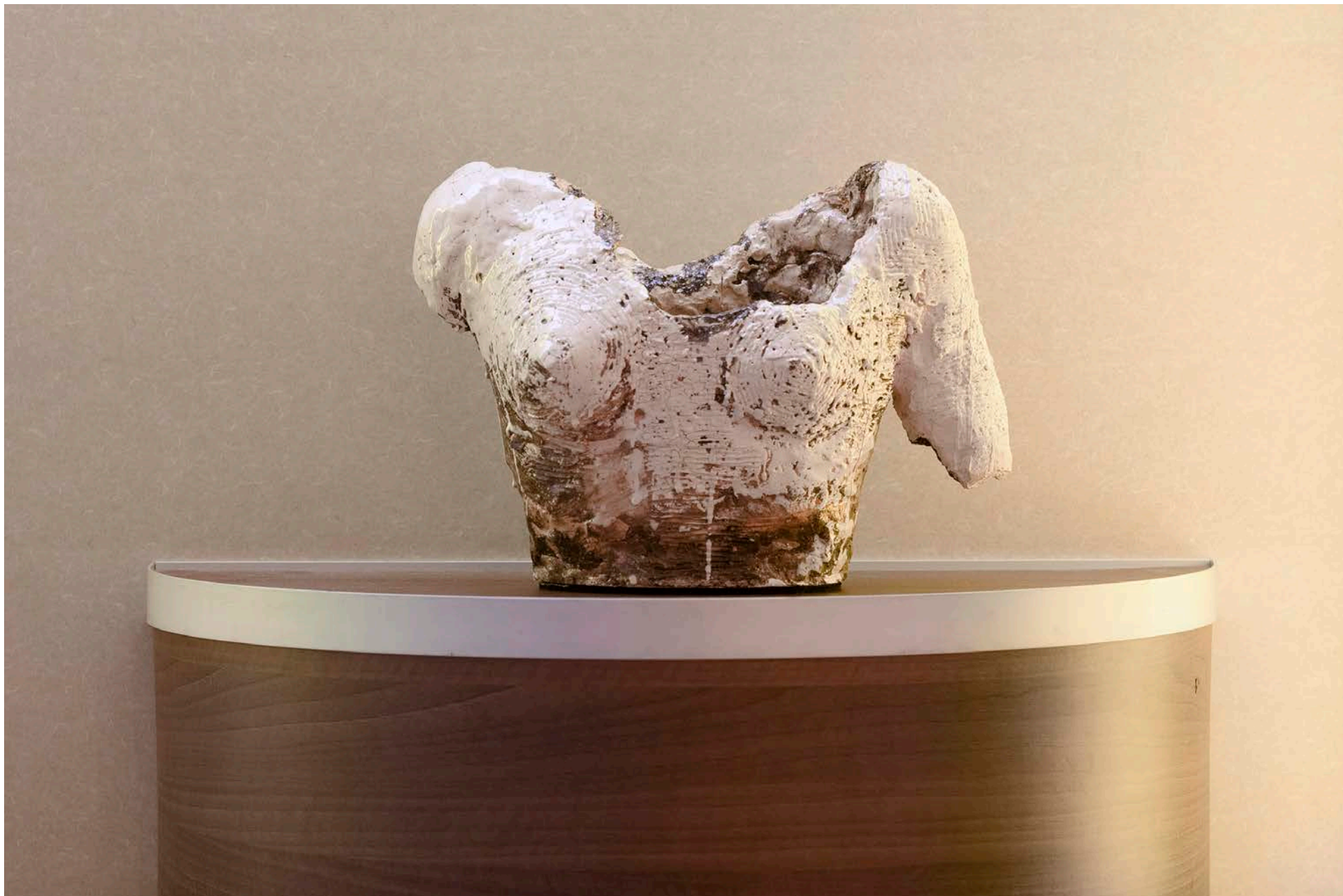
frammentazione del corpo di una donna (the fragmented body of a woman), 2021 Ceramic, glaze 32,5 x 15,5 x 22,5 cm

View in the exhibition Your Body, Your Temple Stella (former artist-run space), Berlin (2022)