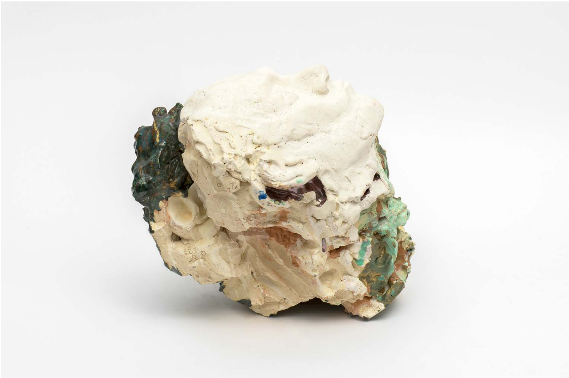
Untitled, 2019 Ceramic, glaze 25 x 36 x 26 cm