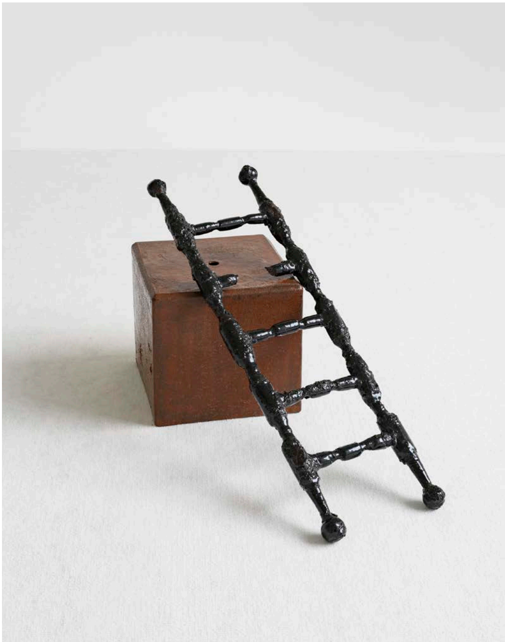
Untitled (the cube and the ladder), 2021 Ceramic, glaze Dimensions variable