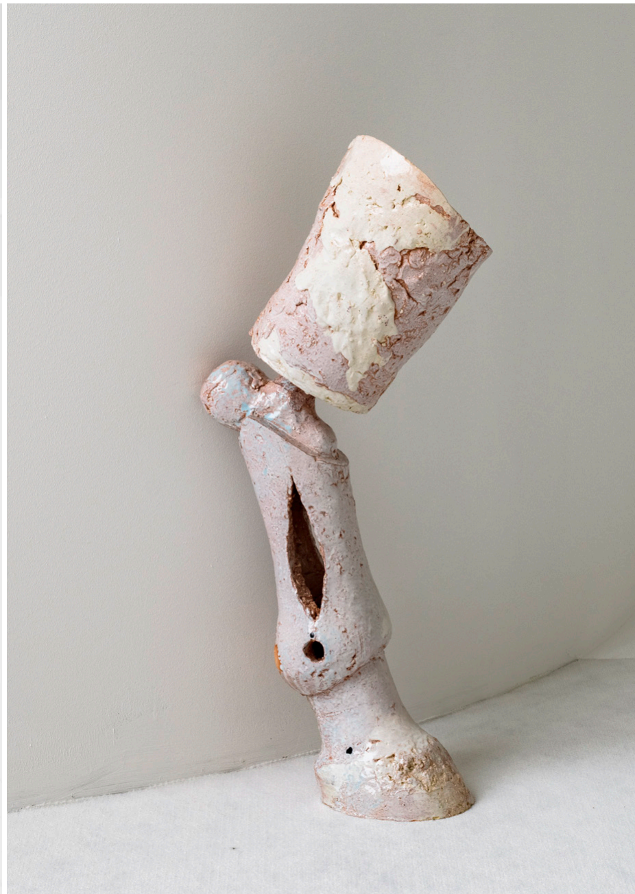
Untitled (prosthetics for horses 3/4), 2021 Ceramic, glaze, 70 x 42 x 19 cm