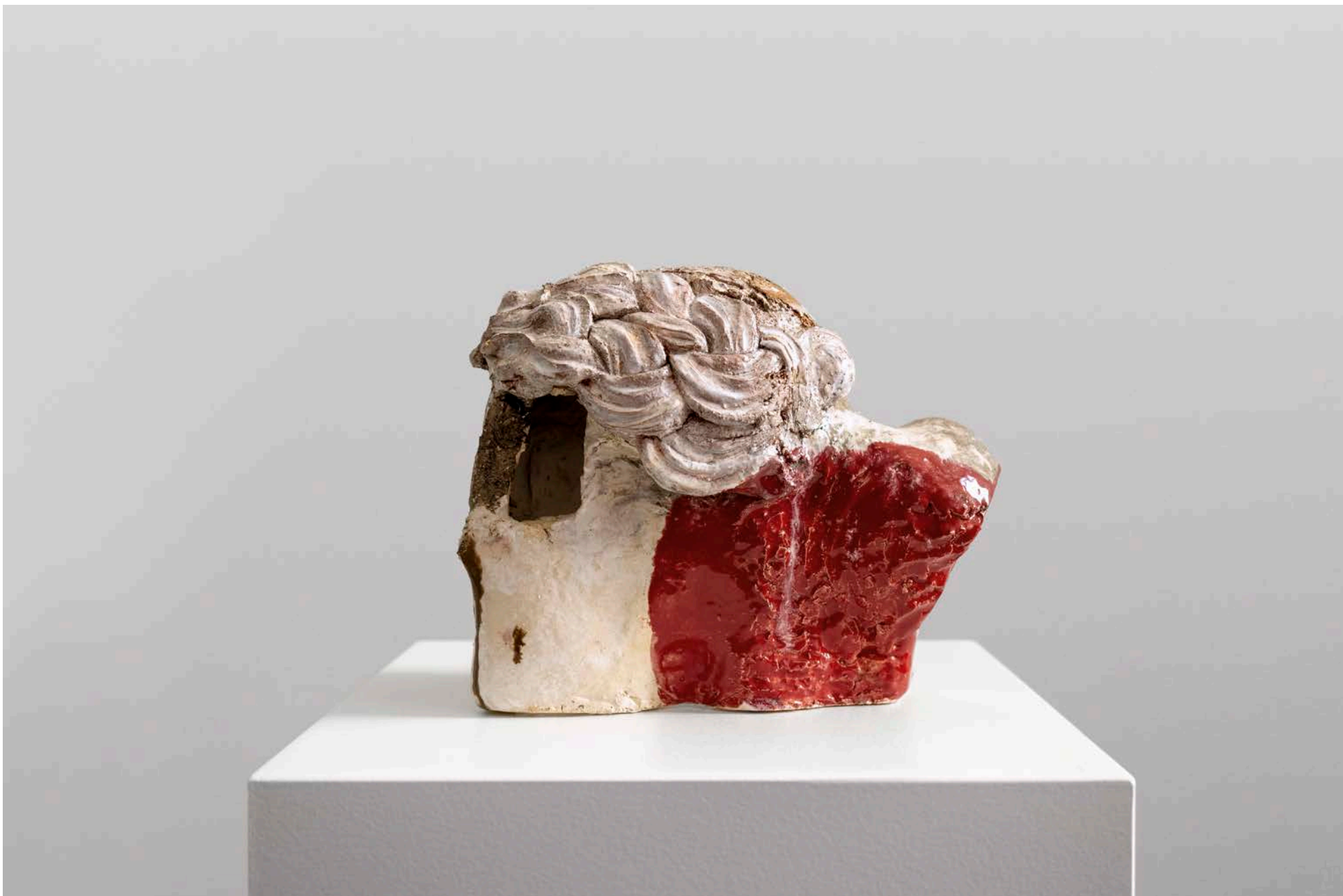
Dorothea Brooke, 2021 Ceramic, glaze 30 x 13,5 x 24,5 cm