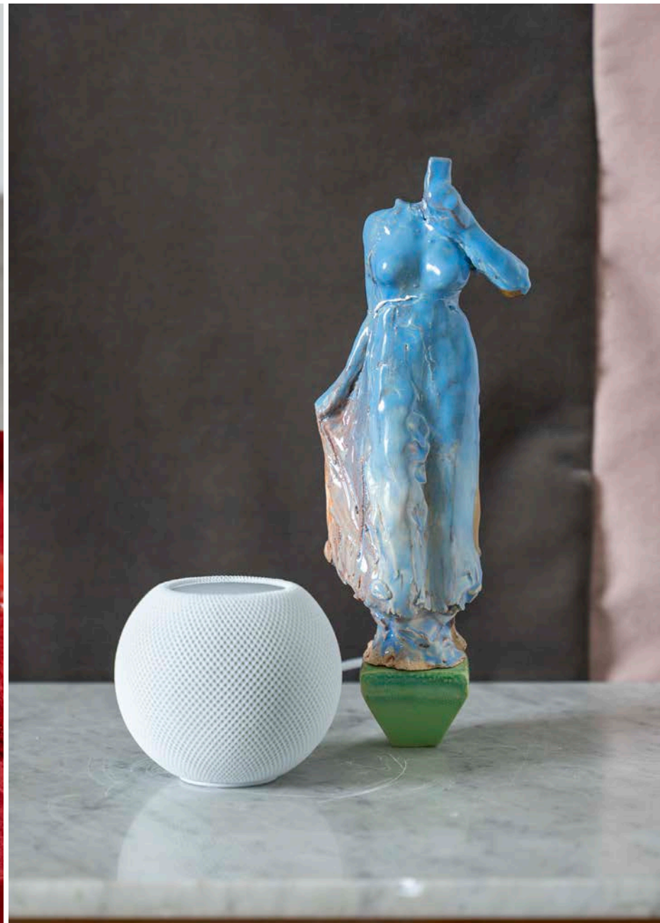
Details of the installation Blowing Dandelion Seeds , 2020 Multimedia installation with sound (11 mins, loop) Dimensions variable