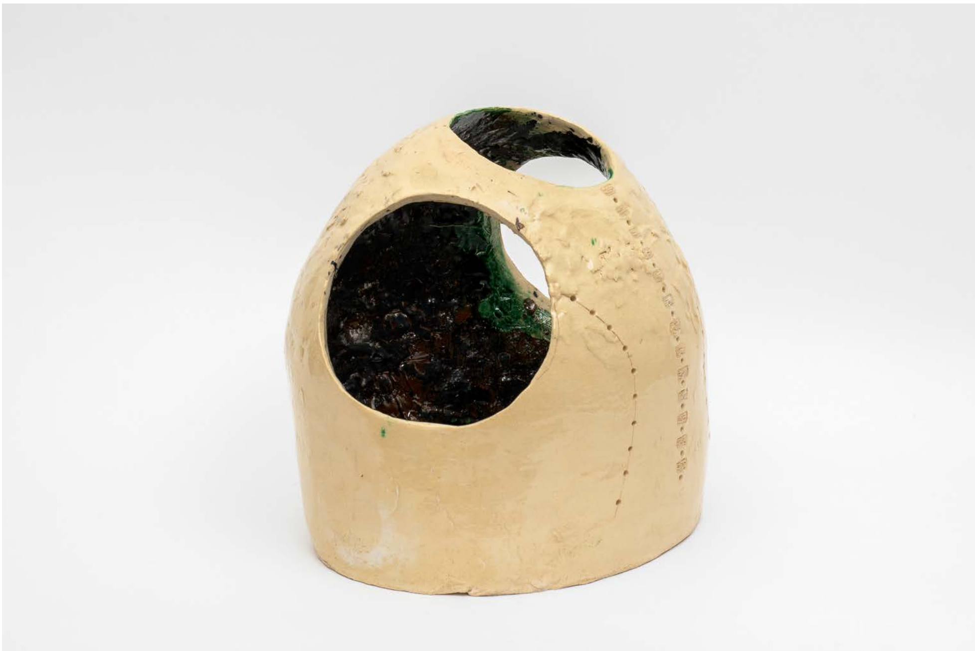
Untitled (part of the yet untitled series 2/8), 2024–25 Ceramic, glaze 36 x 34 x 38 cm