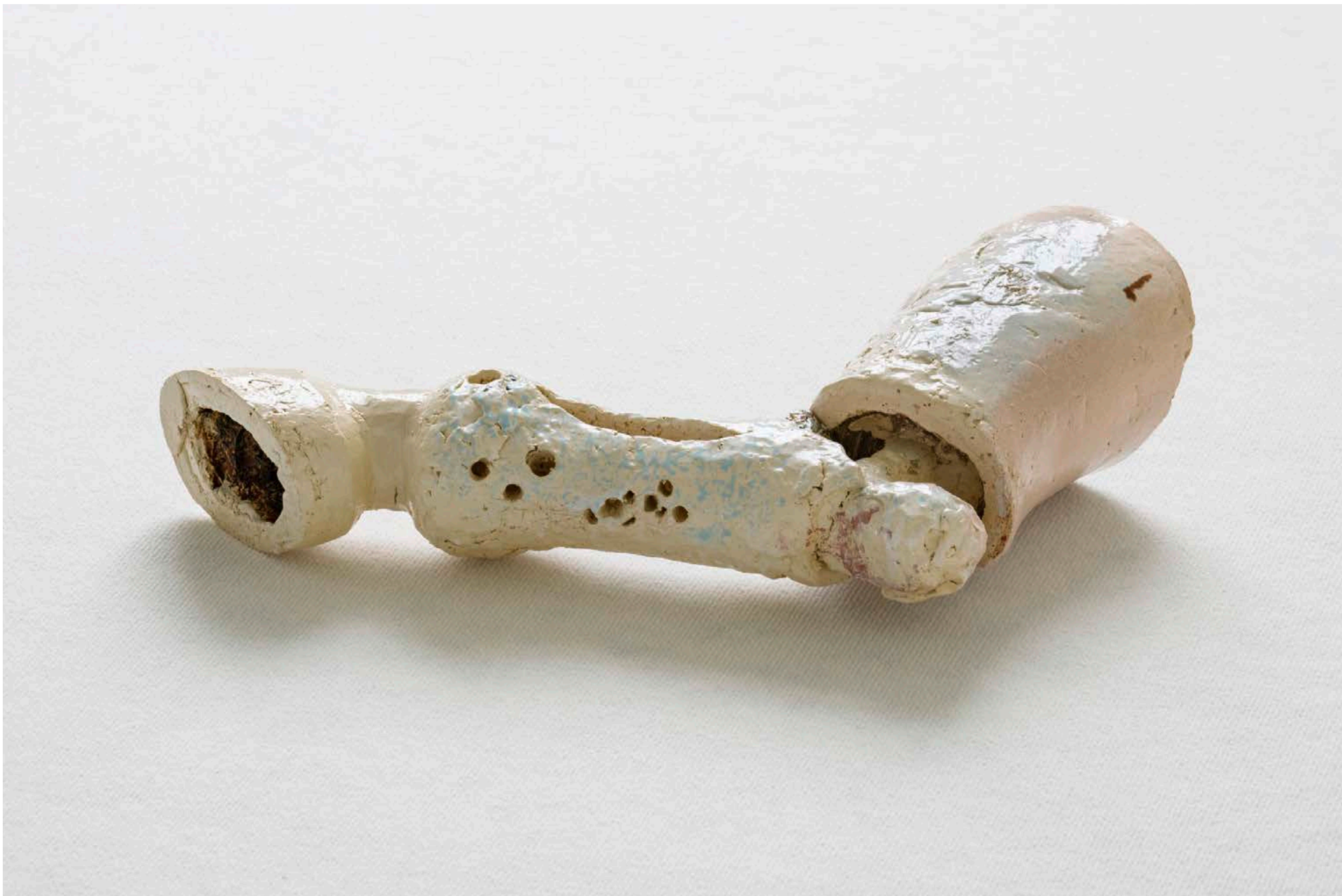
Untitled (prosthetics for horses 4/4), 2021 Ceramic, glaze 40 x 20 x 75 cm