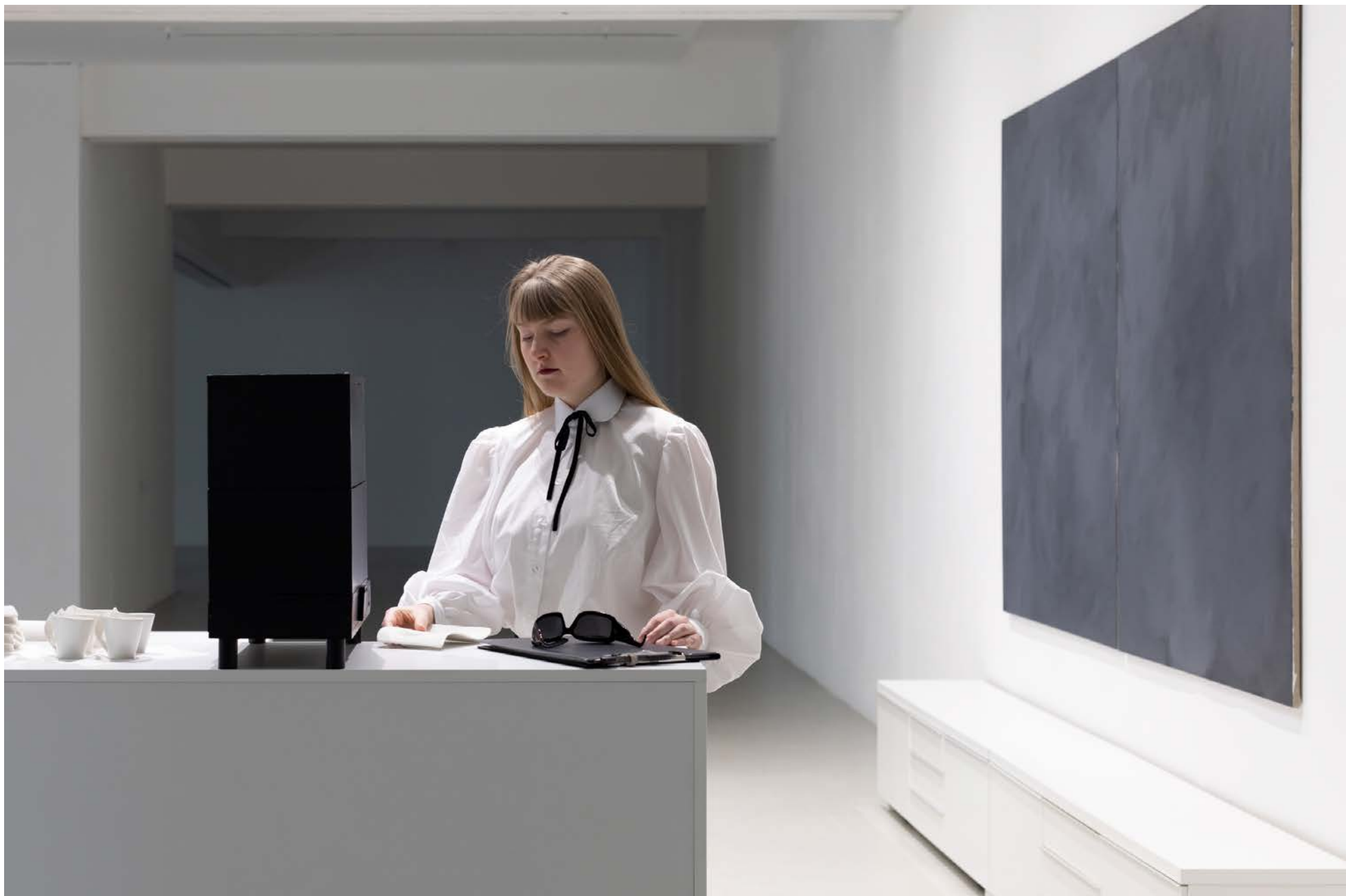
Lazybones, 2022 Lecture-performance and installation 20 mins