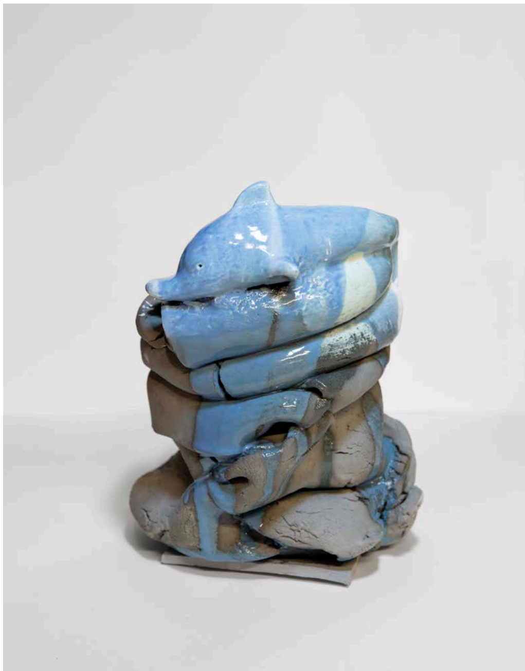
Untitled, 2024 Ceramic, glaze 24,5 x 19 x 18,5 cm