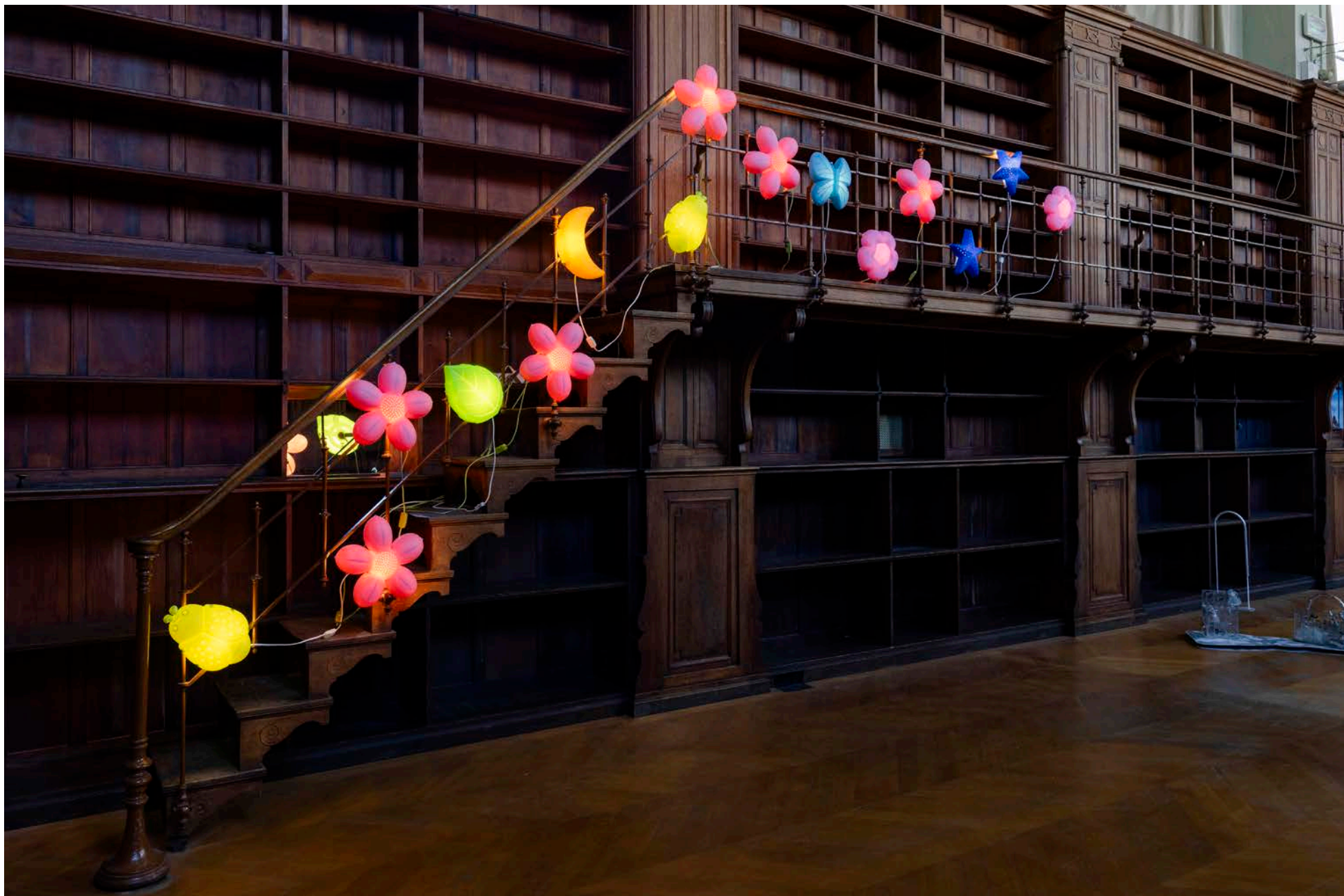
NATTLJUS / BLOMSTRANDE ÄNG, 2023 Hand engraved second-hand IKEA lamps, motion detector Dimensions variable