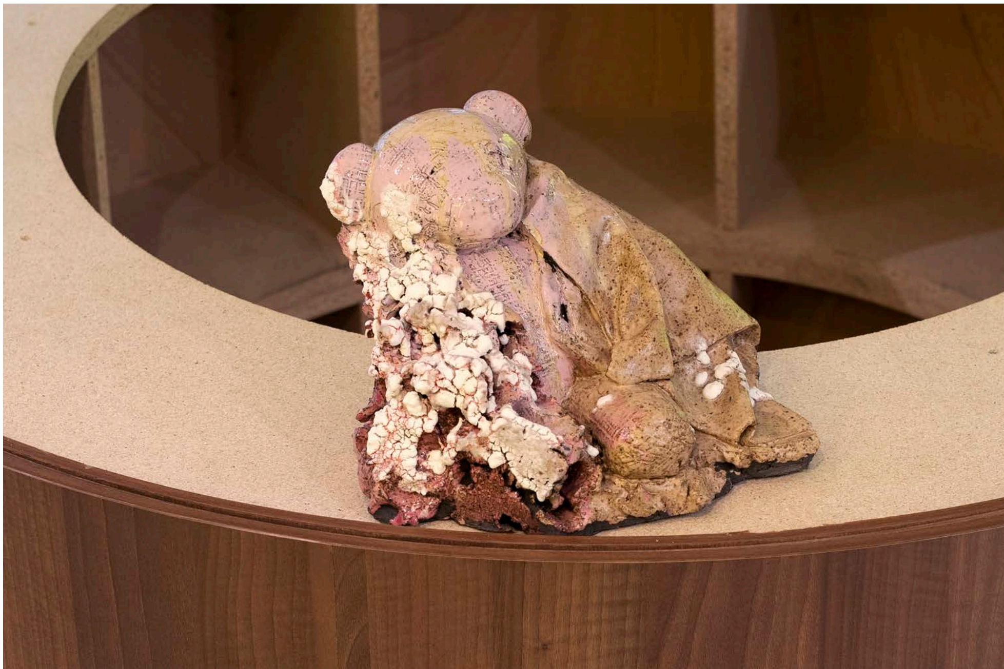
Not yet titled (Teddy), 2021 Ceramic, glaze 24 x 25 x 19 cm