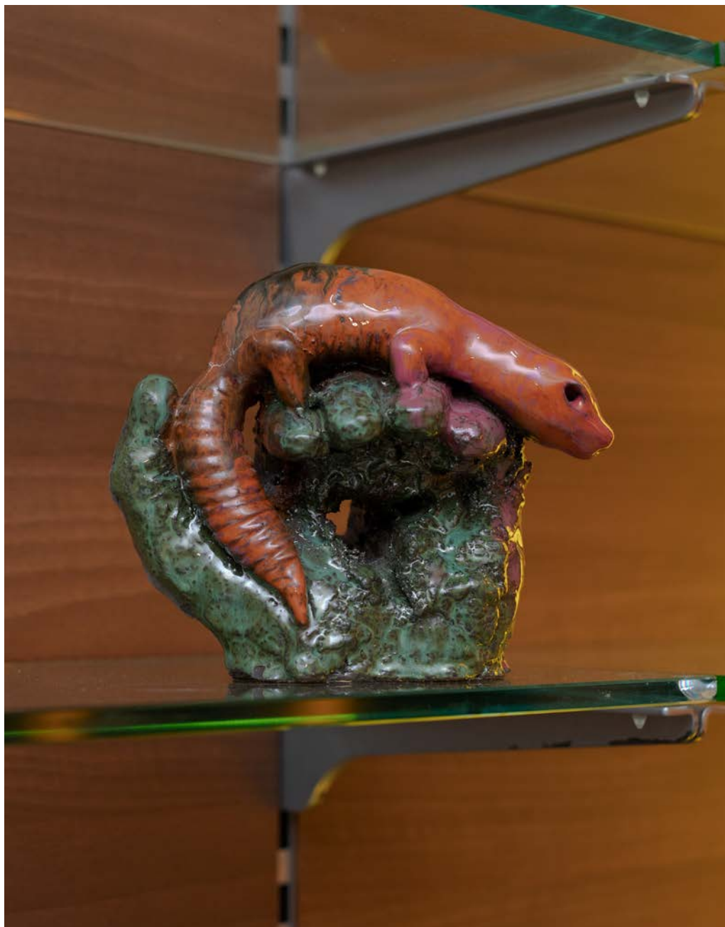
Not yet titled, 2021 Ceramic, glaze 19 x 15 x 9 cm