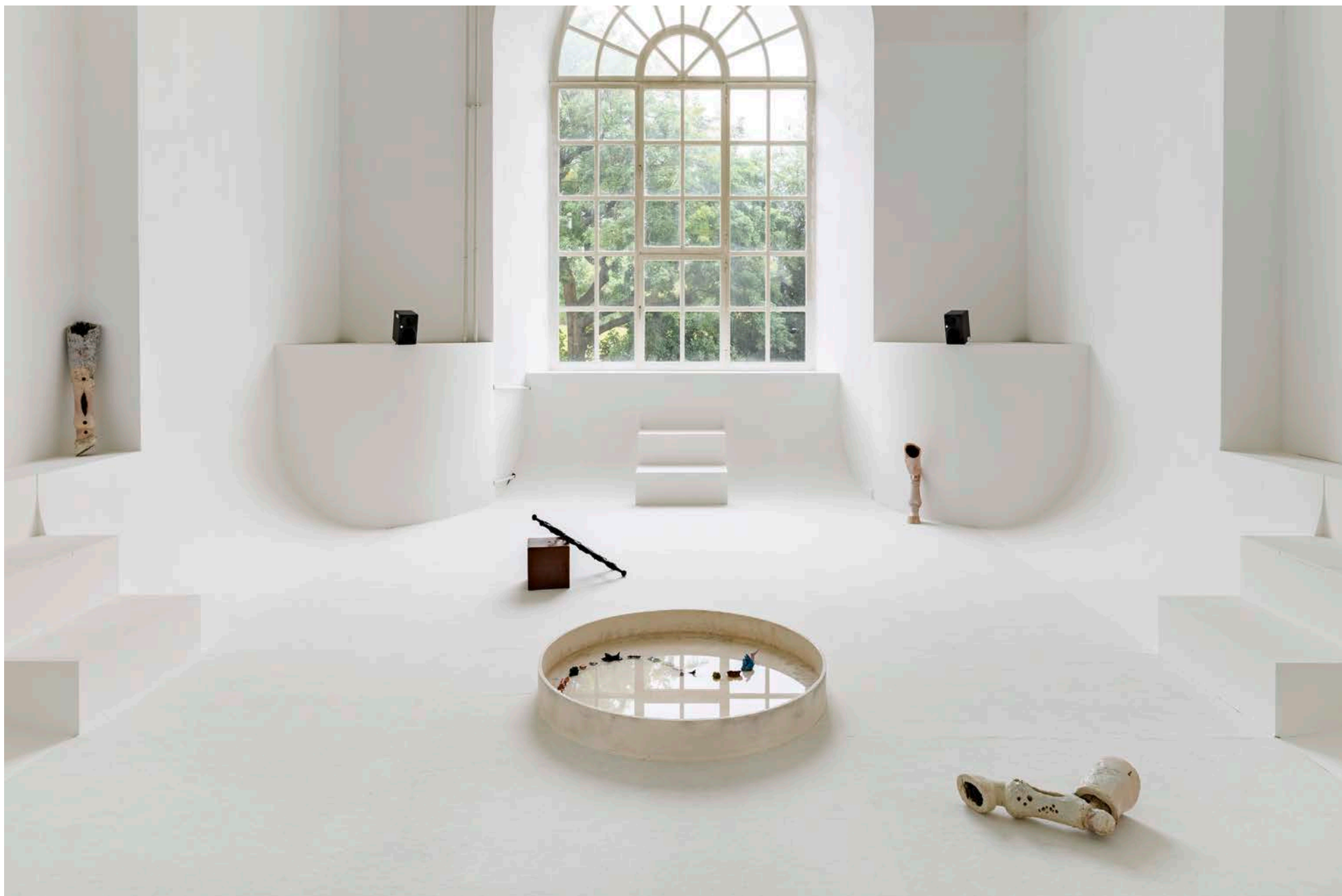
DeepSéance, 2021 Multimedia installation with sound (30 mins, loop) Dimensions variable