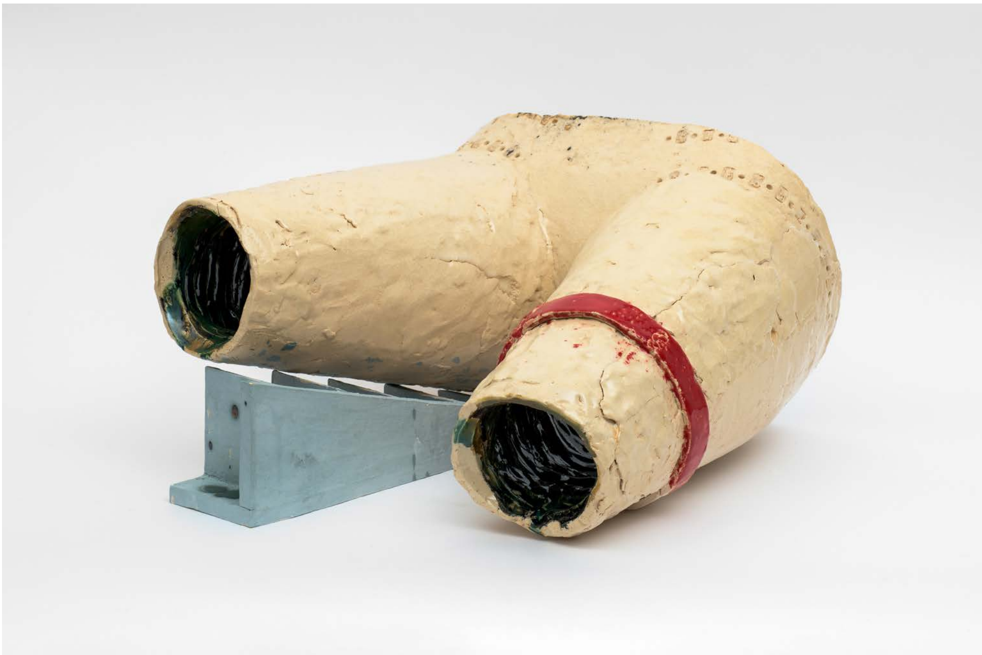
Untitled (part of the yet untitled series 3/8), 2024–25 Ceramic, glaze 28 x 41 x 45 cm