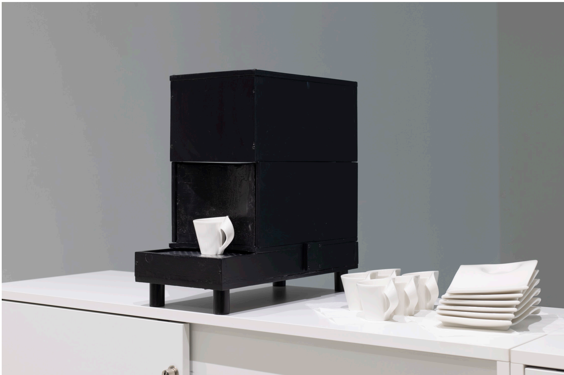
Details of the installation Lazybones , 2022 Lecture-performance and installation 20 mins