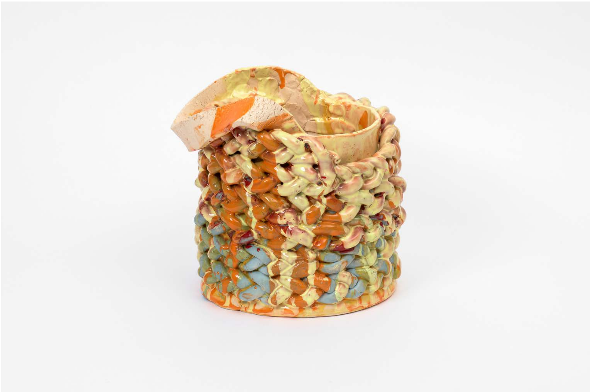
Untitled (part of the yet untitled series 6/8), 2024–25 Ceramic, glaze 22 x 24 x 23 cm