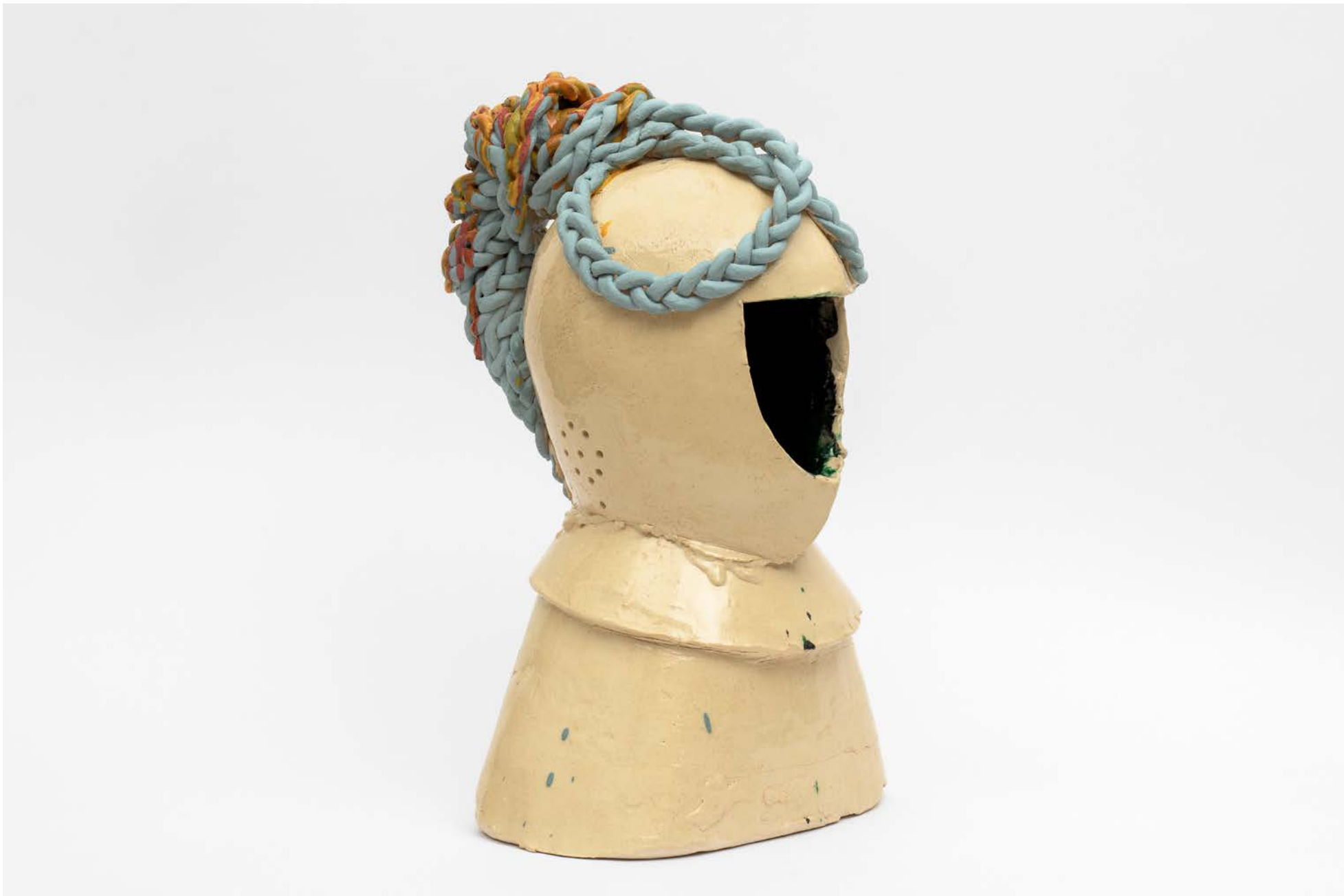
Untitled (part of the yet untitled series 1/8), 2024–25 Ceramic, glaze 52 x 32 x 35 cm