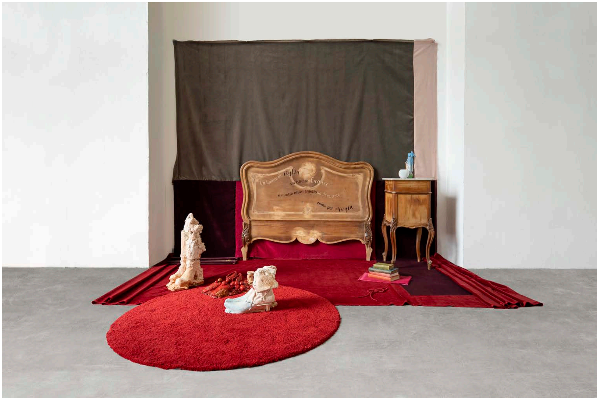
Blowing Dandelion Seeds, 2020 Multimedia installation with sound (11 mins, loop) Dimensions variable