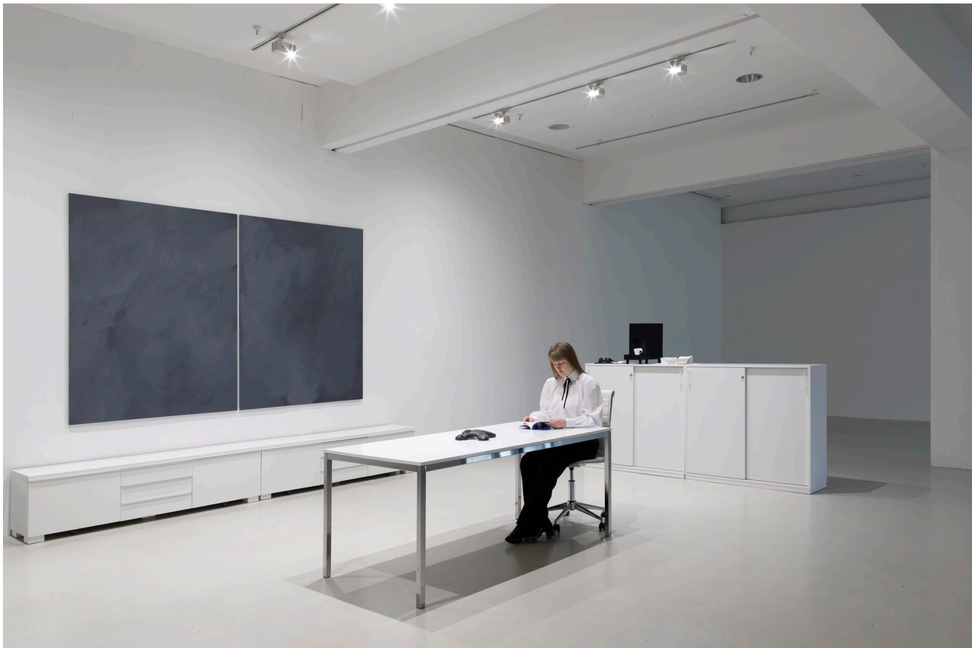
Lazybones, 2022 Lecture-performance and installation 20 mins