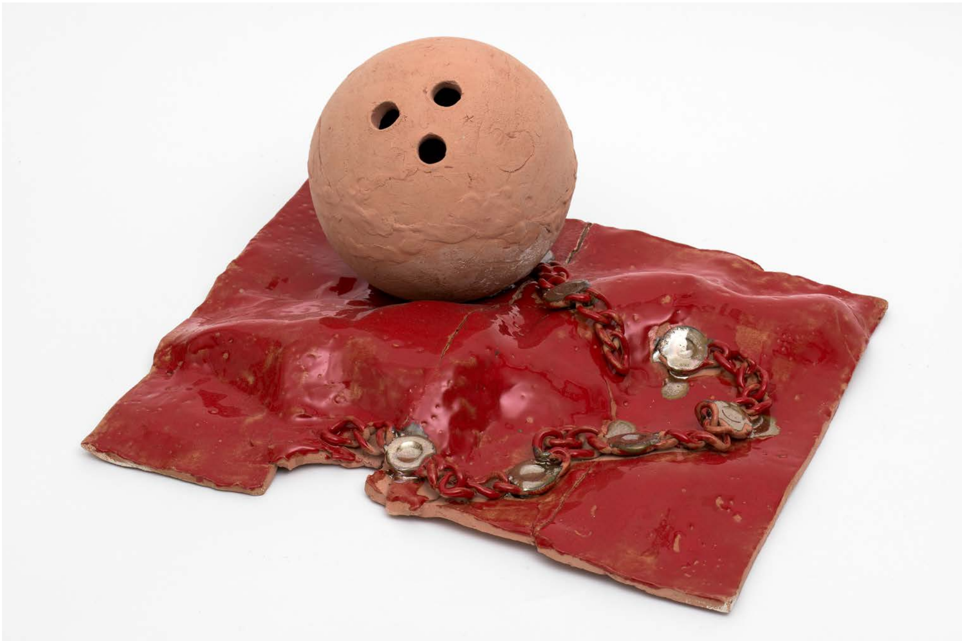
Untitled (part of the yet untitled series 7/8), 2024–25 Ceramic, glaze 20 x 44 x 37 cm