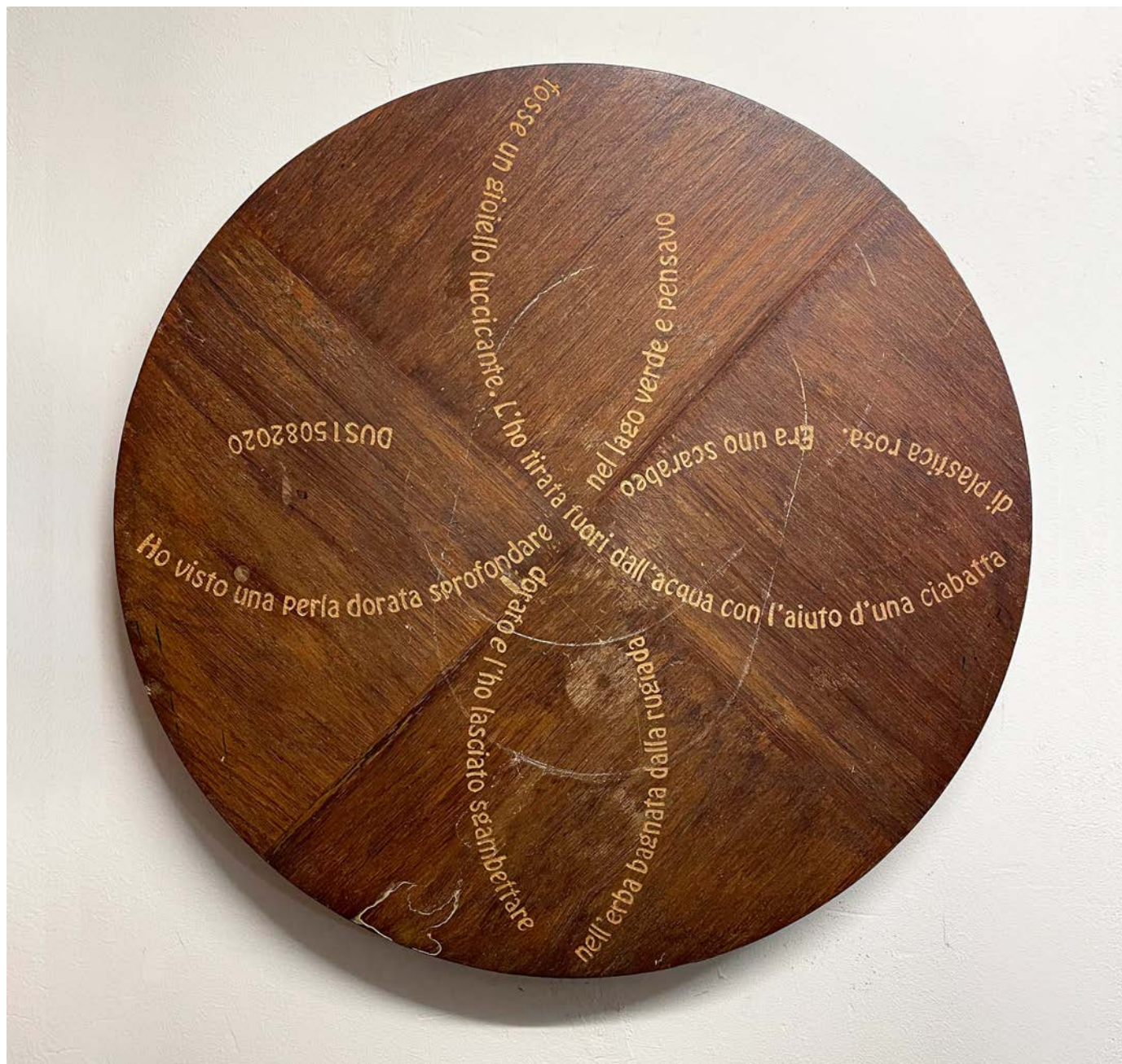
DUS15082020, 2021 Hand-engraved wood table top 70 x 70 x 5 cm