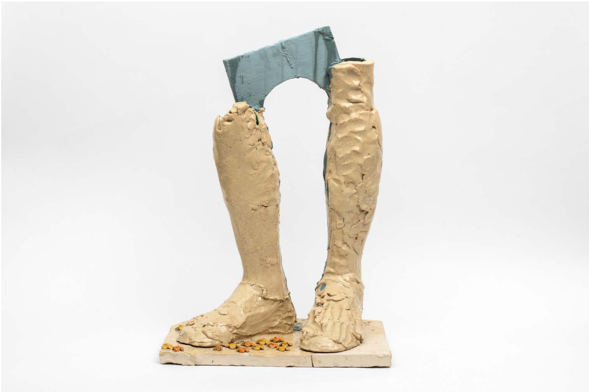
Untitled (part of the yet untitled series 4/8), 2024–25 Ceramic, glaze 59 x 40 x 29 cm