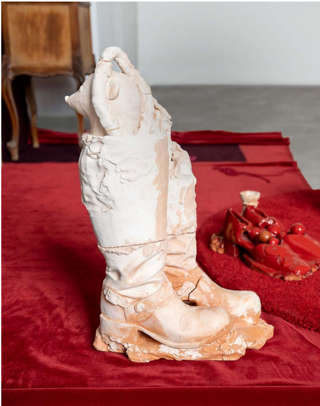
Nancy (muddy boots), 2020 Ceramic 33 x 29 x 58 cm