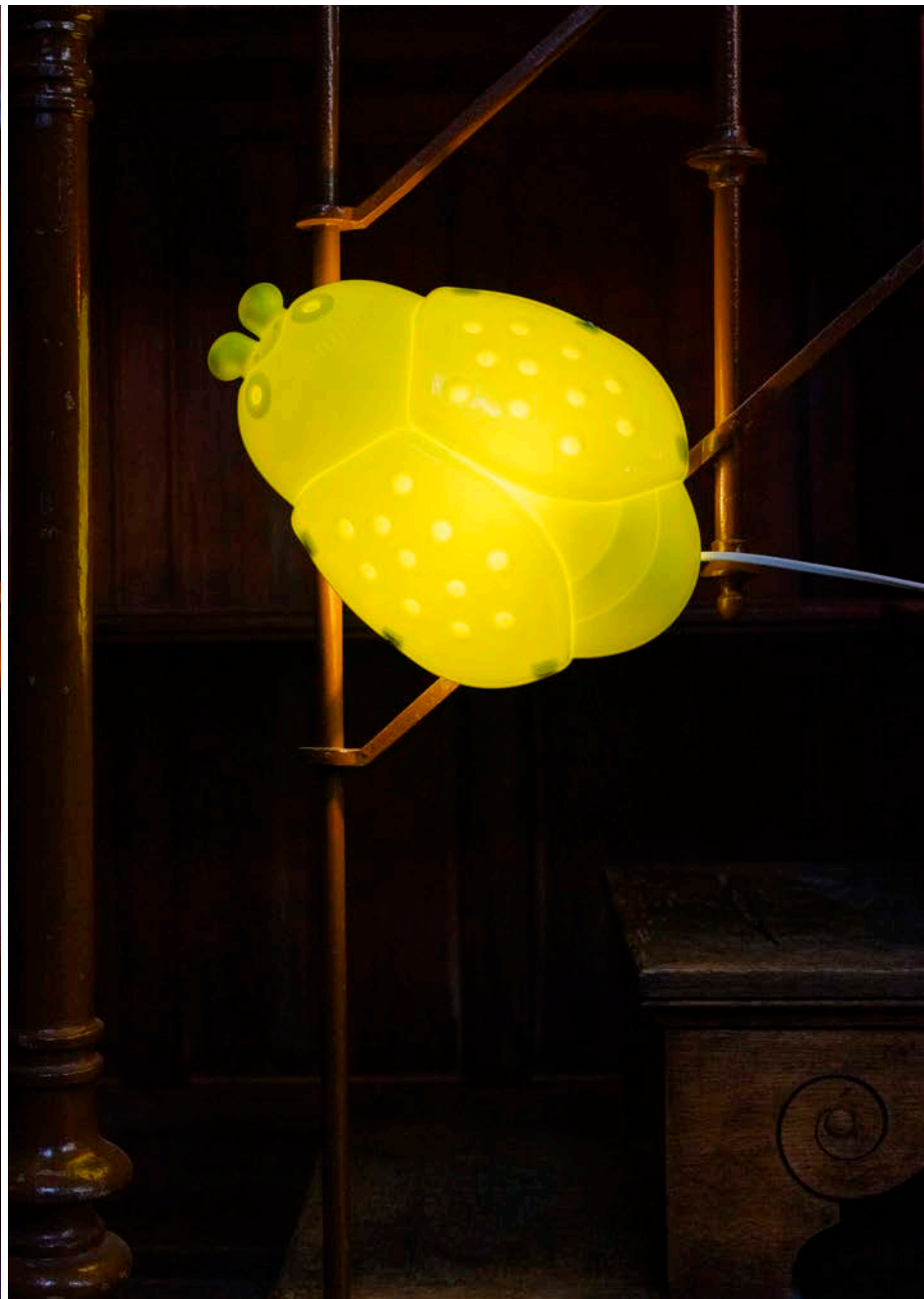
Details of the installation NATTLJUS / BLOMSTRANDE ÄNG , 2023 Hand engraved second-hand IKEA lamps, motion detector Dimensions variable