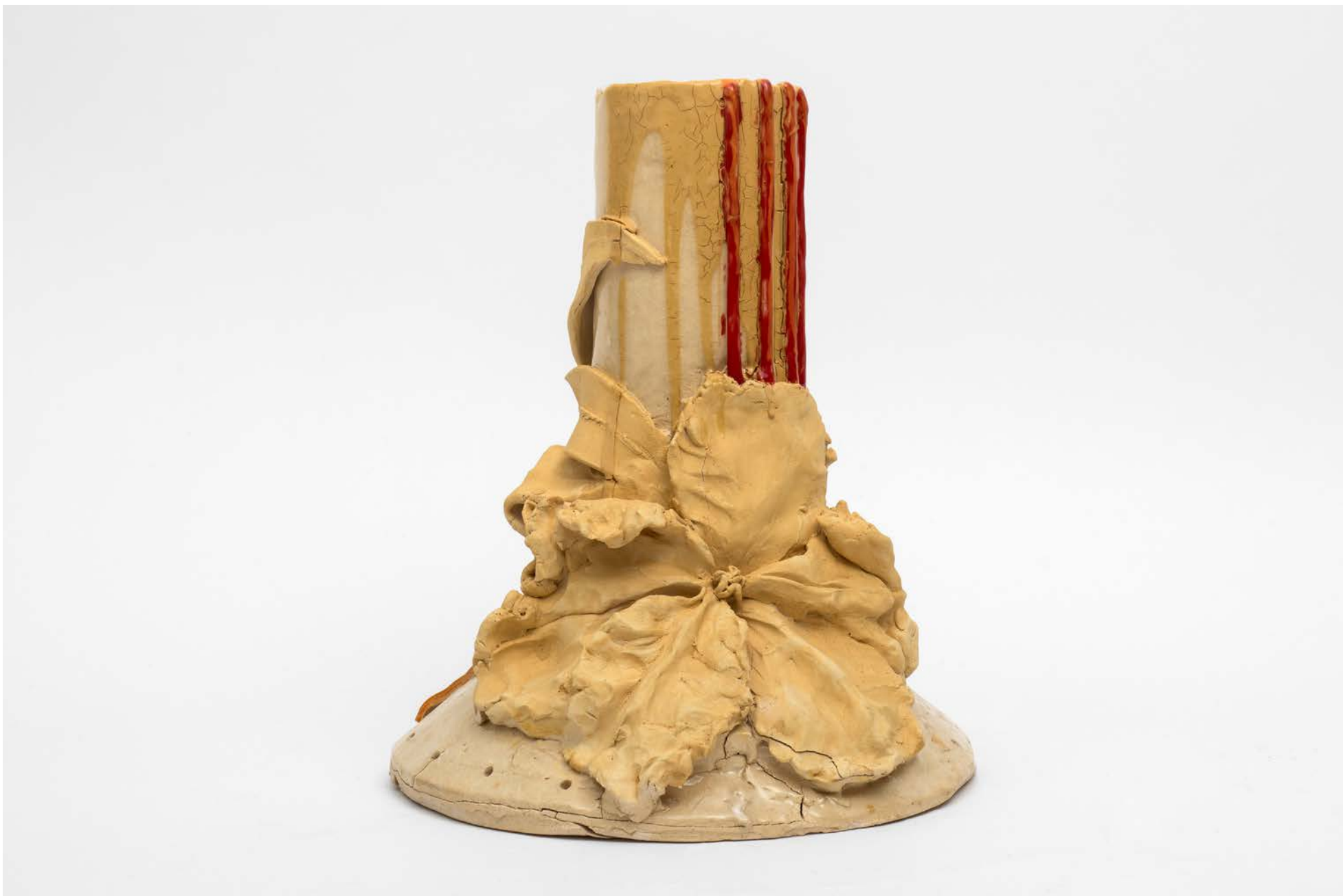
Untitled (part of the yet untitled series 5/8), 2024–25 Ceramic, glaze 36 x 30 x 30 cm