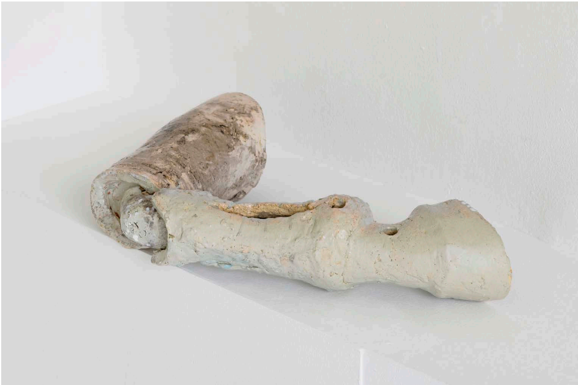
Untitled (prosthetics for horses 2/4), 2021 Ceramic, glaze 60 x 40 x 20 cm