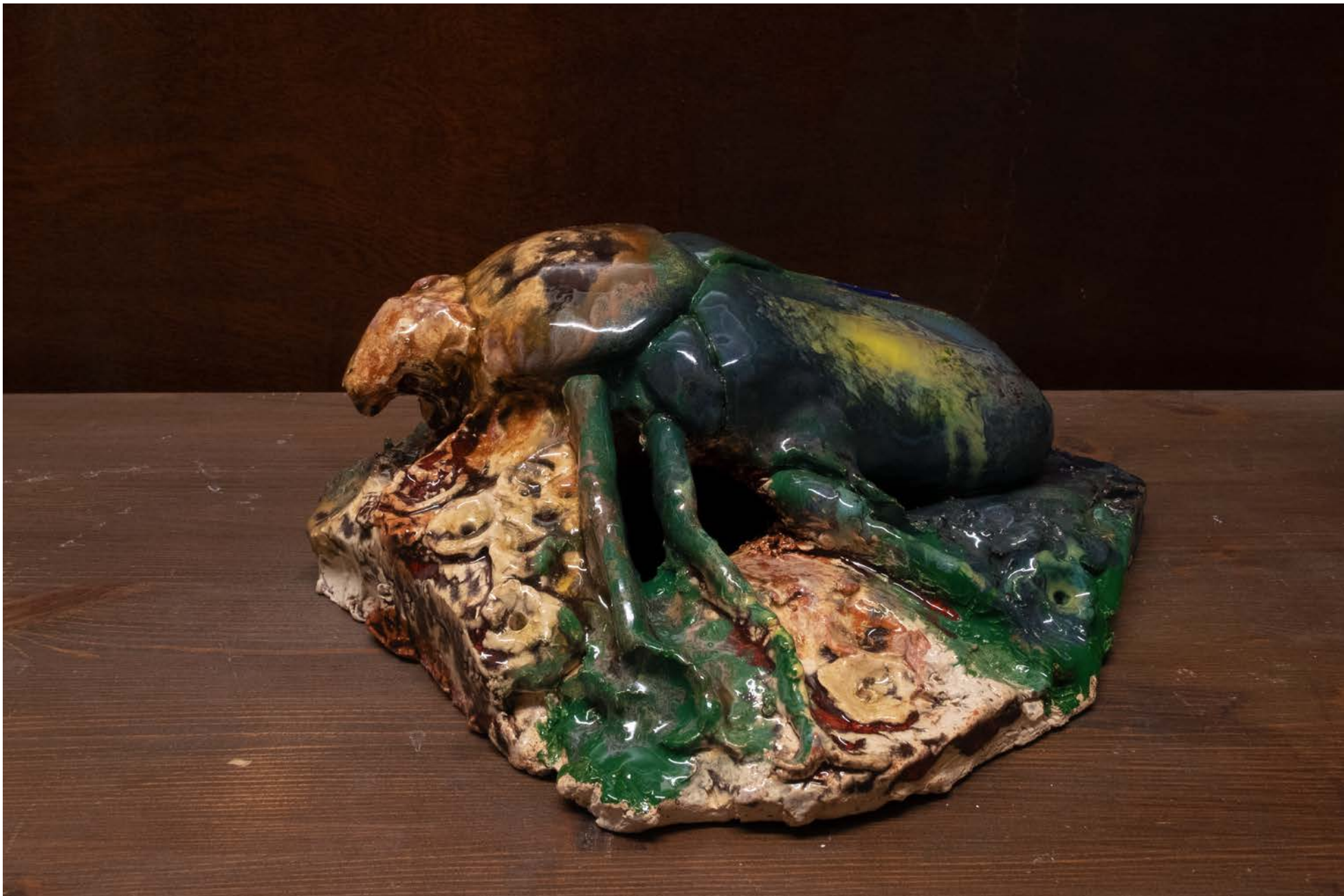
cetonia aurata, 2021 Ceramic, glaze 23 x 24 x 11 cm

View in the group exhibition and yes I say yes I will yes Salon am Moritzplatz, Berlin (2021)